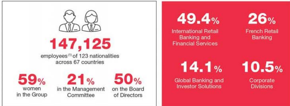
Figure 6: Global Presence of SG – Breakdown of Staff by Geographical Region