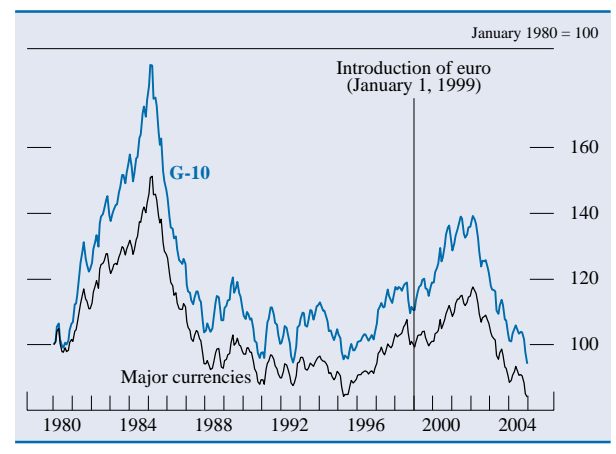
NOTE. Data are monthly averages of daily values.

Nominal major currencies and G-10 indexes of the foreign exchange value of the U.S. dollar, 1980–2004