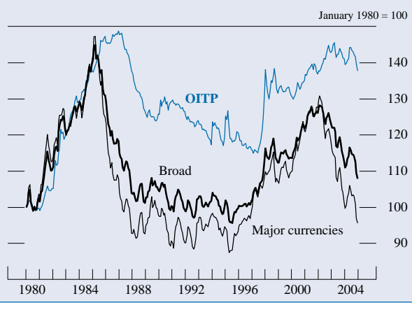
NOTE. Data are monthly.

2. Real (price-adjusted) indexes of the foreign exchange value of the U.S. dollar, 1980–2004