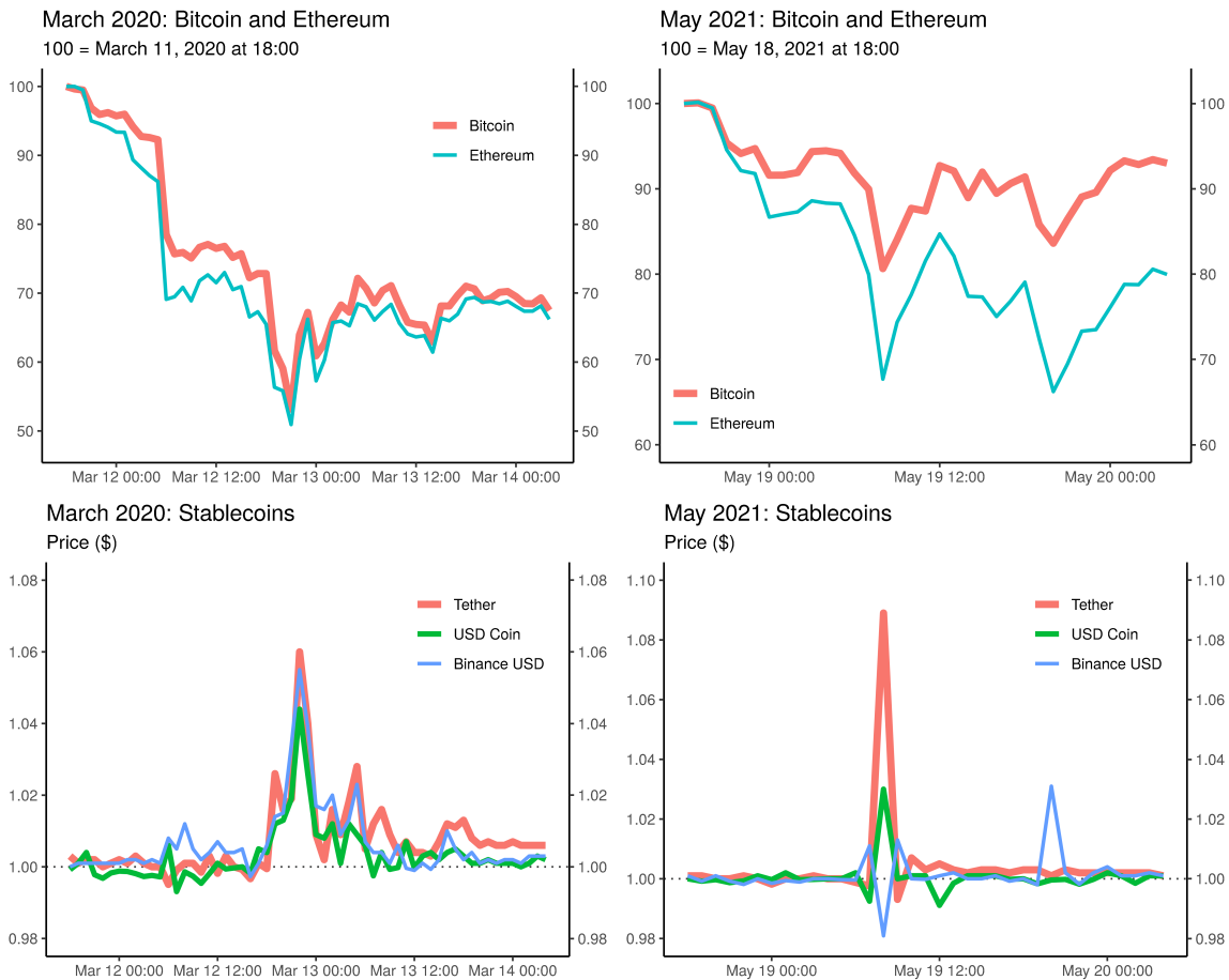
Figure 2: Public stablecoins appreciate during crypto market distress

Note: Hourly prices of stablecoins, Bitcoin and Ethereum. Time is in GMT. Bitcoin and Ethereum prices are in U.S. dollars, indexed to March 11, 2020 and May 18, 2021.