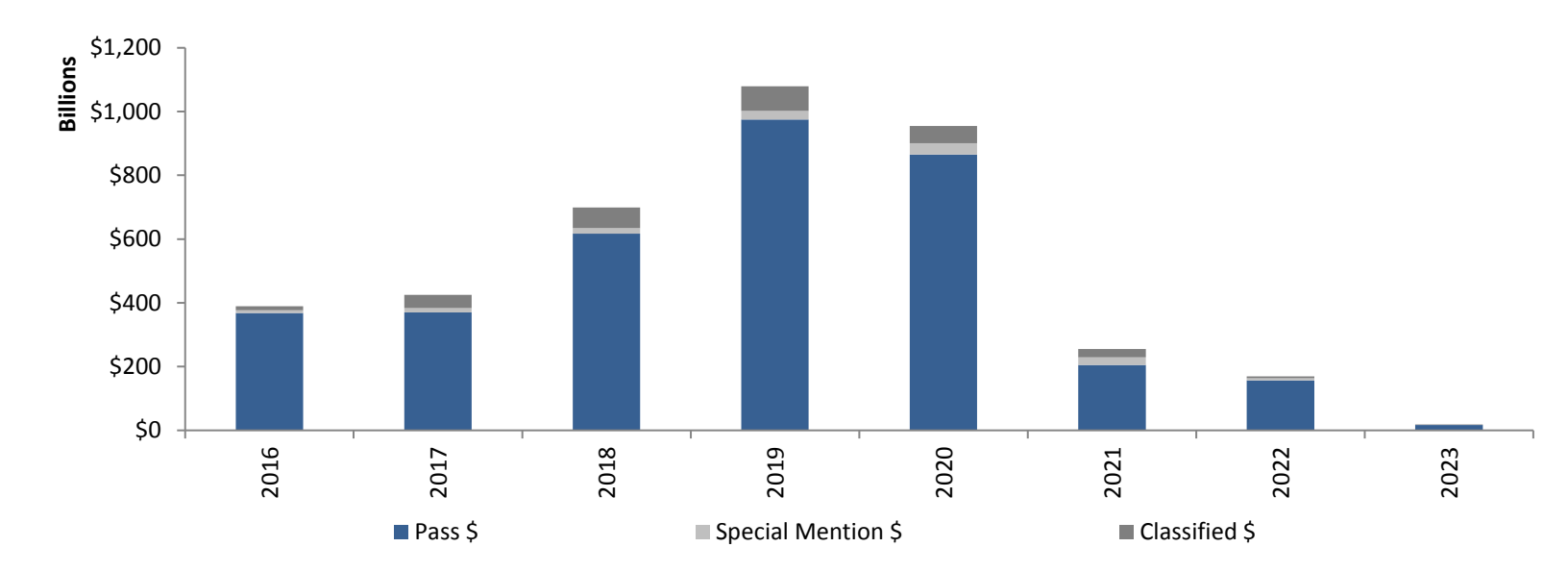
Appendix E: Maturity Profile